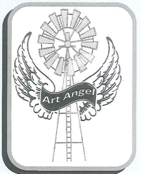
"Art Angel" Pin

IRS Code Sec. 6115: The amount deductible as a contribution is the excess of the contribution over the good faith estimate of the value of the goods or services received by the donor.