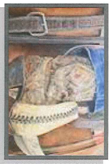
San Antonio Livestock Exposition, Inc. Student Western Art Contest Winner—2016