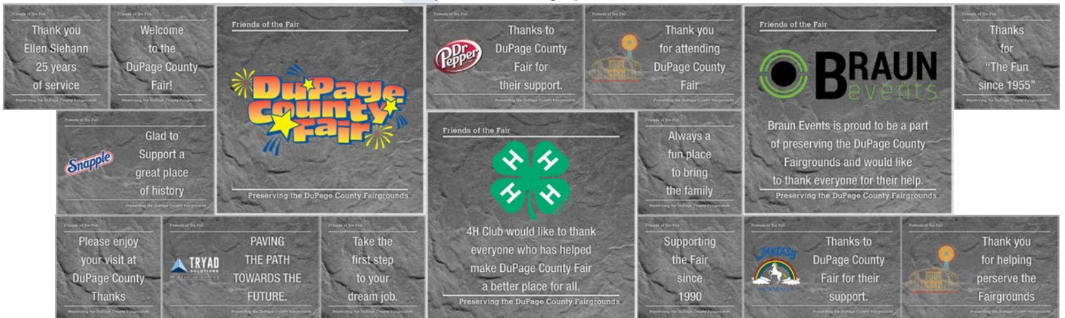
Asphalt textured graphic decal

The Friends of the DuPage County Fair are dedicated to preserving the rich agricultural history of DuPage County and the use of the DuPage County Fairgrounds. We continue to improve current structures and are planning new facilities to create greater opportunities for the community. Please help us “Pave the way to our Future” and support the 62 year tradition of the DuPage County Fairgrounds.