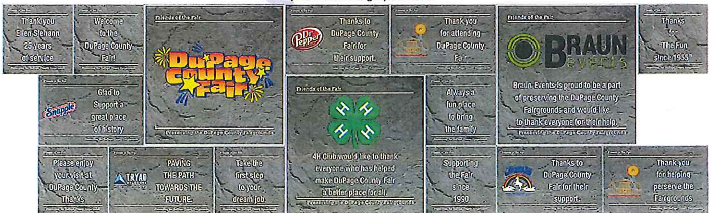
Asphalt textured graphic decal

The Friends of the DuPage County Fair are dedicated to preserving the rich agricultural history of DuPage County and the use of the DuPage County Fairgrounds. We continue to improve current structures and are planning new facilities to create greater opportunities for the community. Please help us "Pave the way to our Future" and support the 62 year tradition of the DuPage County Fairgrounds.